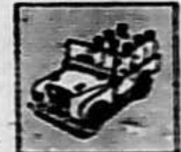
Can take more