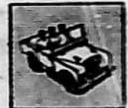
Three front seats