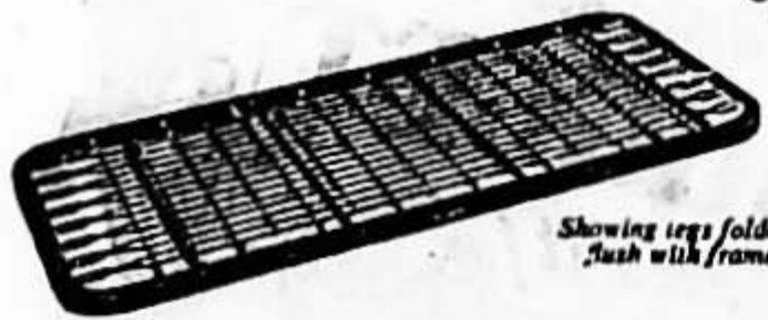
Showing legs folded flush with frame