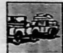
Tows heavy loads